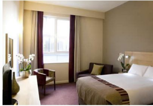
Jurys Inn Hotel, Aberdeen UK: Union Square, Guild Street, Aberdeen, AB11 5RG