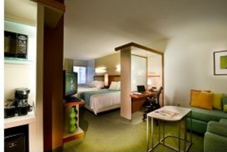
Springhill Suites by Marriott, Lake Charles USA

Other than offering courses in Singapore, this course is also available in Indonesia, Australia, United Kingdom and USA. COMING SOON at 3 NEW Locations; Manchester (UK), Great Yarmouth (UK) and New Delhi (India).